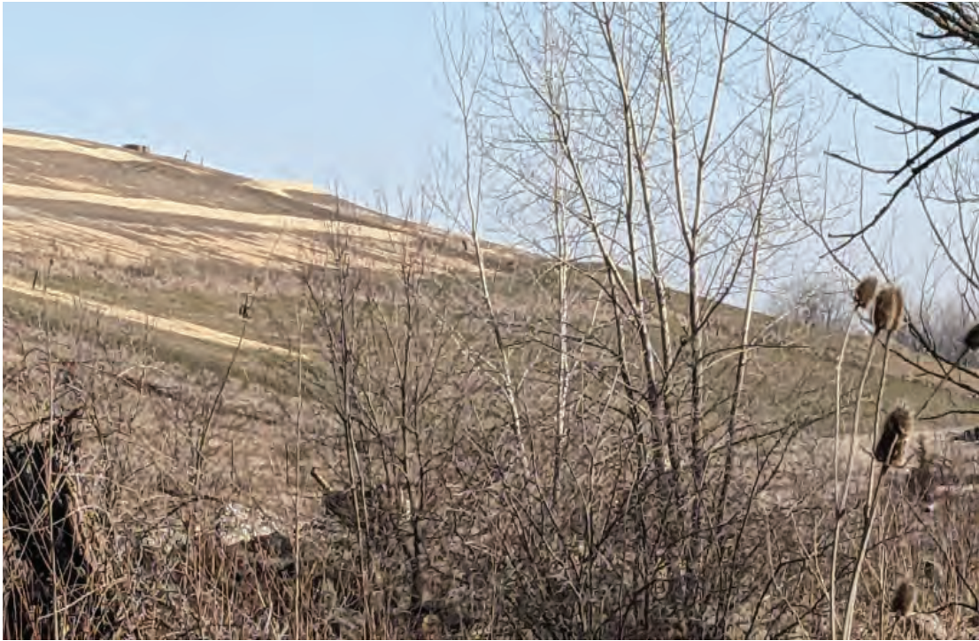
Cap project awaiting seeding and minor erosion repairs