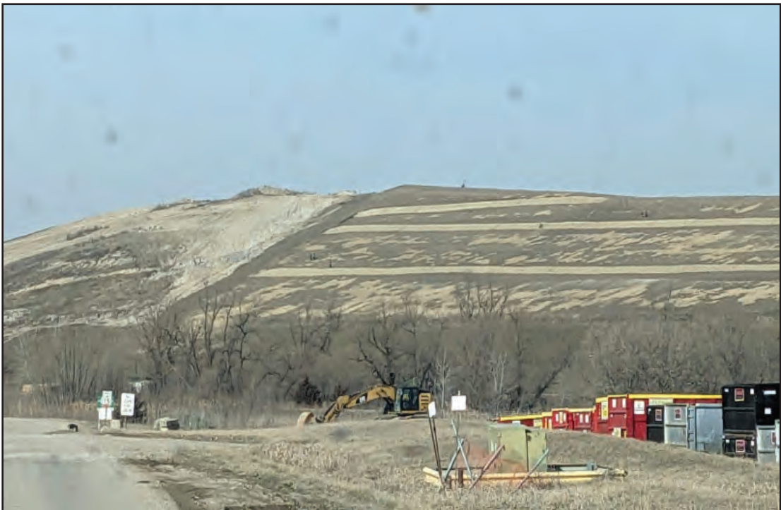
Cap project awaiting seeding and minor erosion repairs