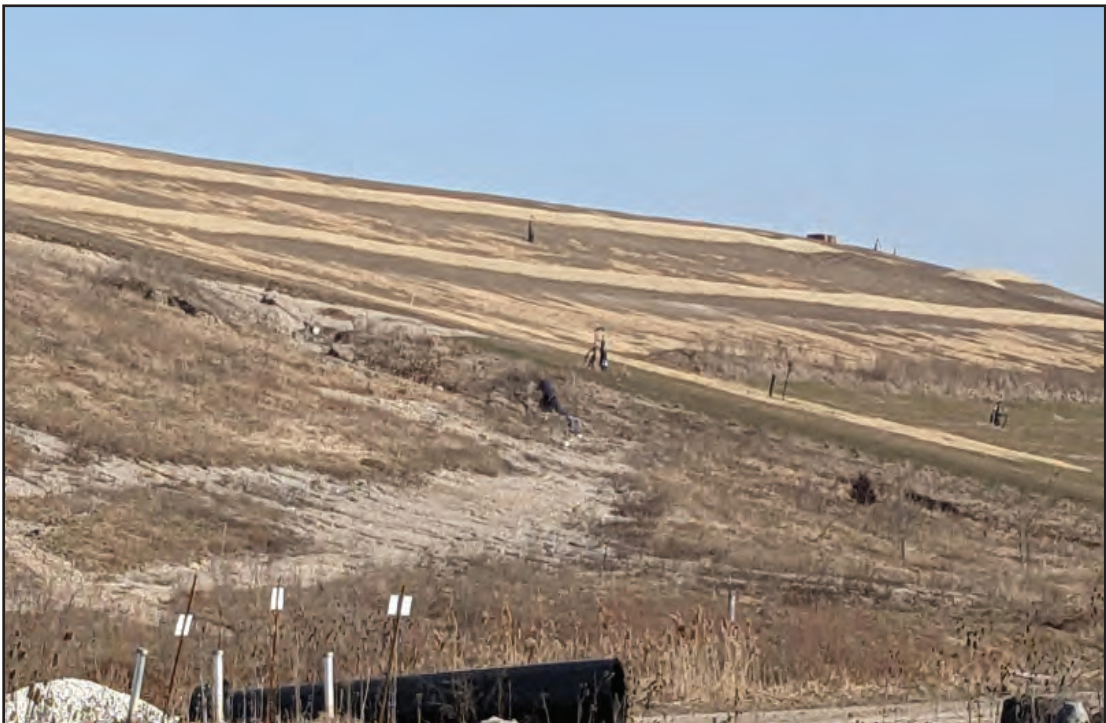
Cap project awaiting seeding and minor erosion repairs