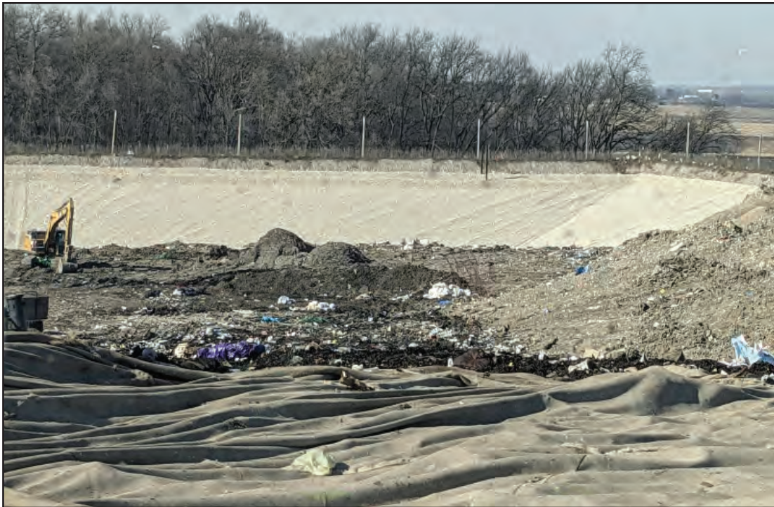
Phase 3 module 2