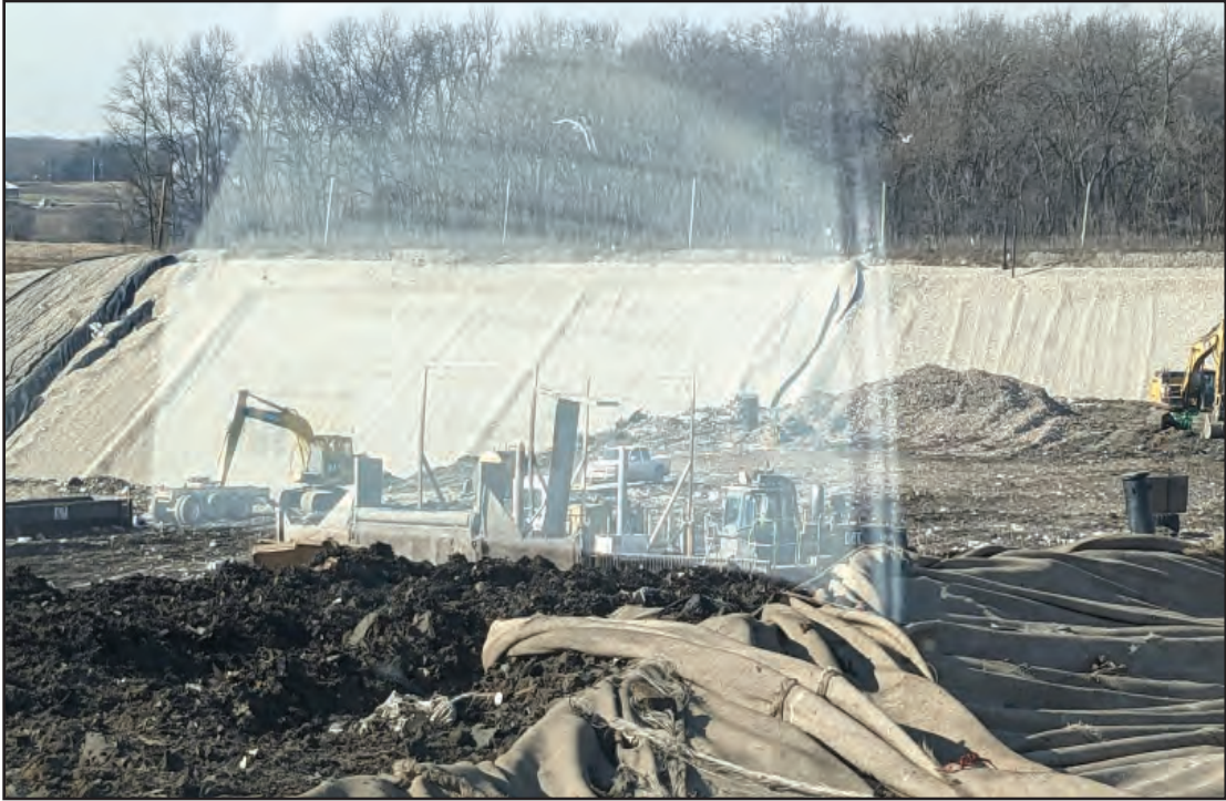
Tipper in Phase 4