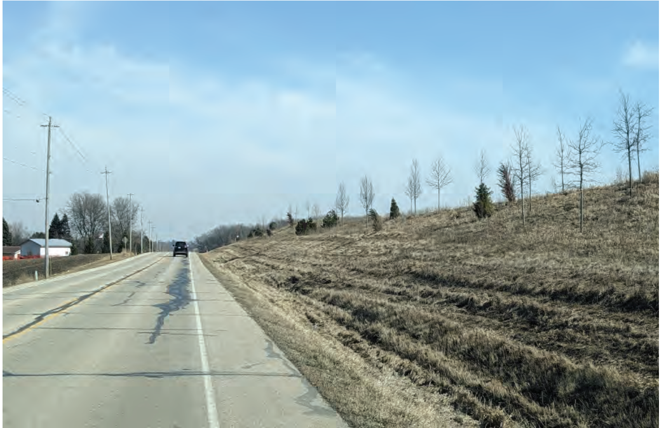
North screening berm, near corner of 38th Street and HWY 45