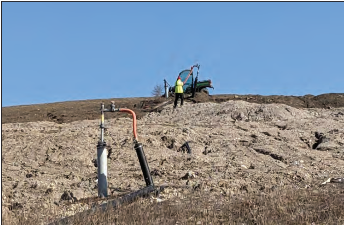
Slope erosion on Phase 2 and gas tech actively tweaking well field