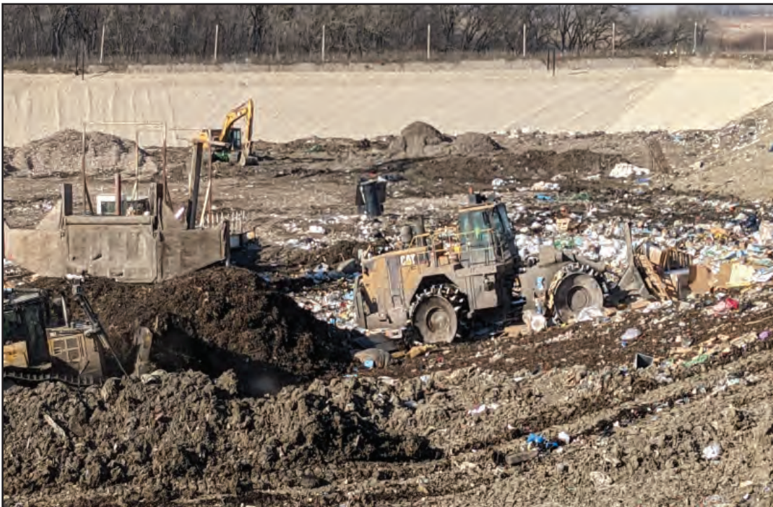
Phase 3 & 4 being brought to same elevation