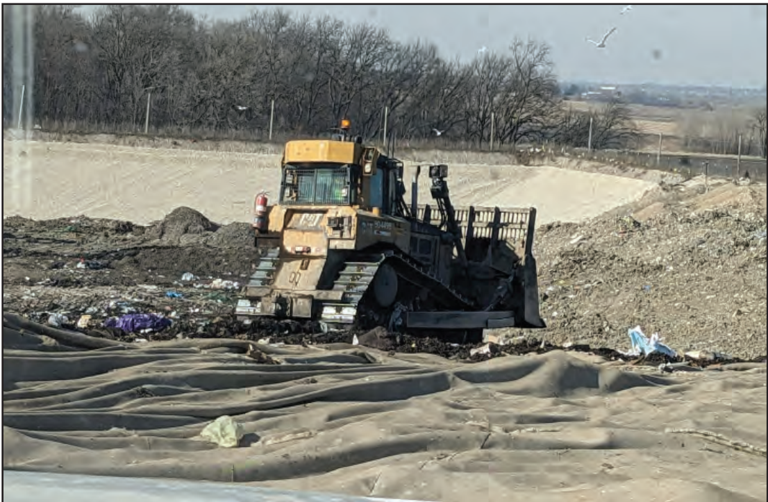
Dozer shaping cover, tarp pulled back on cover