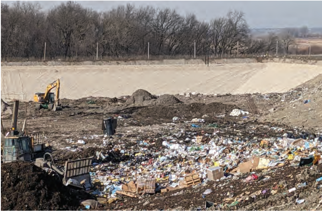
Phase 3 & 4 being brought to same elevation