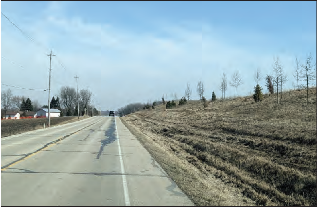
Screening berm along 38th Street; plantings appear to be in bad shape. Contractor responsible for restoration