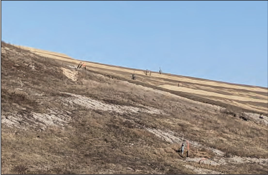
Cap project awaiting seeding and minor erosion repairs