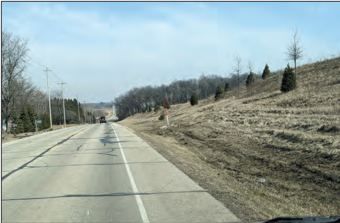
Screening berm along 38th Street; plantings appear to be in bad shape. Contractor responsible for restoration