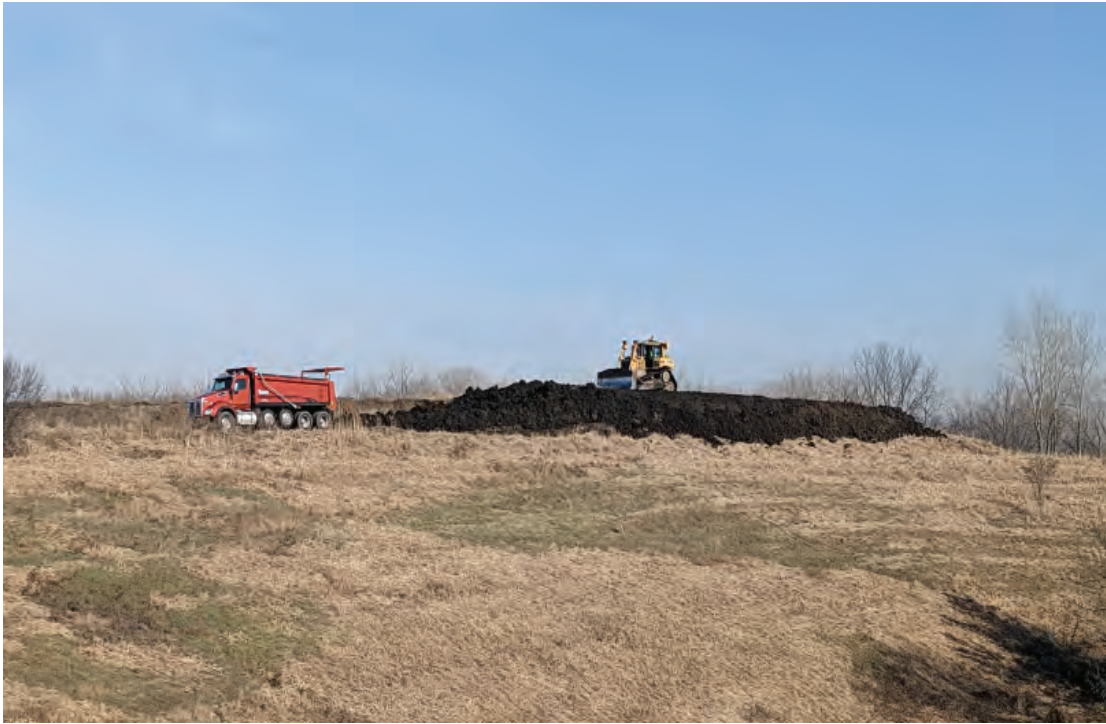
Cap project awaiting seeding and minor erosion repairs