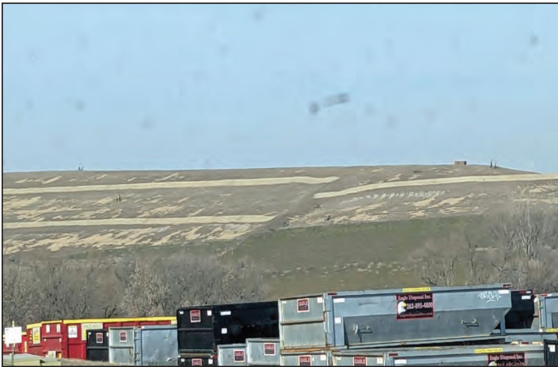
Cap project awaiting seeding and minor erosion repairs