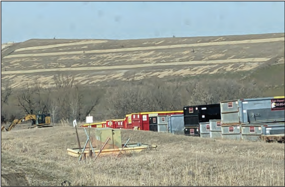
Cap project awaiting seeding and minor erosion repairs