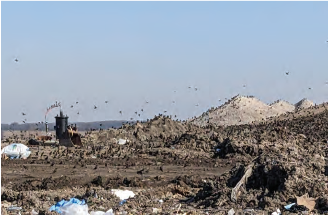
Cover roughly placed during operations